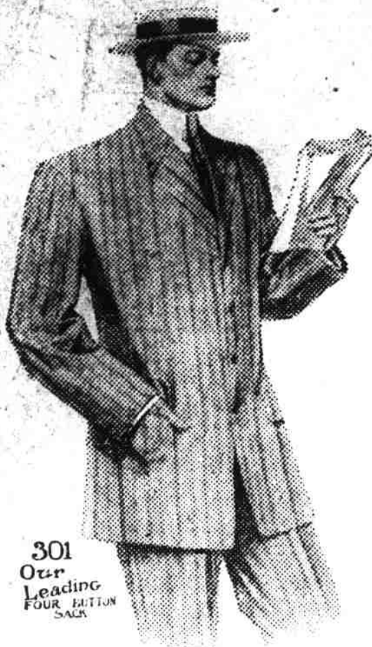
301 Over Leading FOUR EDITION SACKS

Glazener cuts the price and sells the Clothes