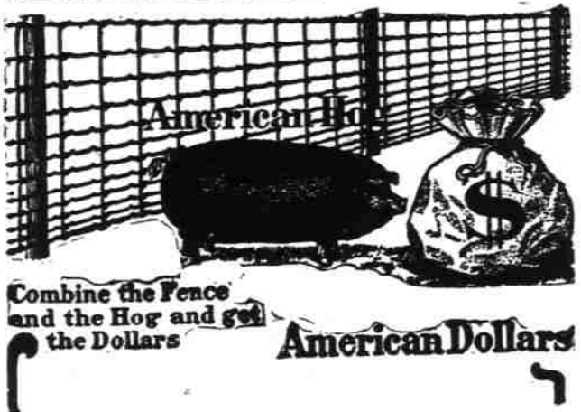
Combine the Fence and the Hog and get the Dollars American Dollars

You, no doubt, are aware that this Fence is made of hard, stiff steel wire, with the best of galvanizing, has the tension curve and hinge joint, which, when pressure is brought against the Fence, it is possible to force the stay out of alignment, and without breaking it.