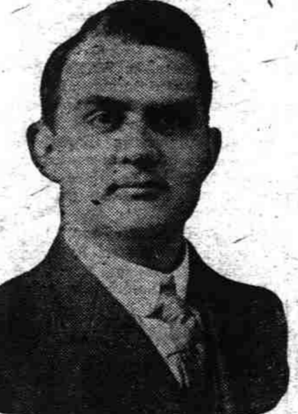
DR. GEORGE B. NYE.

As a result of two days' probing the Franklin county grand jury has indicted five members of the Ohio general assembly for soliciting bribes. One legislative attaché was indicted for aiding and abetting in the solicitation. Although the names of only four had been mentioned in the newspapers in advance, all five of them were in a lawyer's office when the grand jury re-