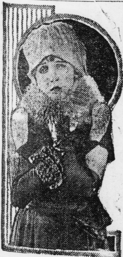
MAE MURRAY in "Peacock Alley"

If you wish to spend an hour of genuine pleasure, and at the same time lend your personal aid to a most worthy cause do not fail to attend the concert to be given by the Oxford Orphanage Singing Class at the Forest City Baptist church Aug. 22, at 8 p. m.