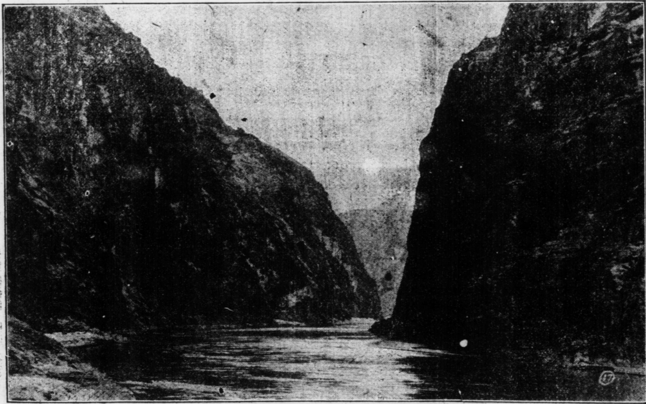
Site of proposed Boulder Dam on Colorado River between Arizona and Nevada. Dam will be 550 feet high, 200 feet at bottom and 1,350 across at top, will impound 26,000,000 acre feet of water or the entire flow of the river for eighteen months, will provide fall for generating 550,000 firm horse power, for which there is a demand when project is completed. The primary object of the Swing Johnson bill before Congress for the construction of this dam is flood control to save Imperial Valley in California from permanent inundation and Yuma, Parker and other valleys in Arizona and Palo Verde Valley in California from annual flood menace. The cost of the dam will be $42,000,000, power plant $31,000,000, All American canal (a part of the project to relieve Imperial Valley from dependence upon Mexico for its water supply), $31,000,000. The total cost of the entire program, including interest during construction is $125,000,000, all of which is to be provided from the sale of power from the dam and sale of water for irrigation. The Federal government underwrites the project, but takes no risk.

Woolsey's heavy body paint is the best. Get it from the Farmers Hardware Co.