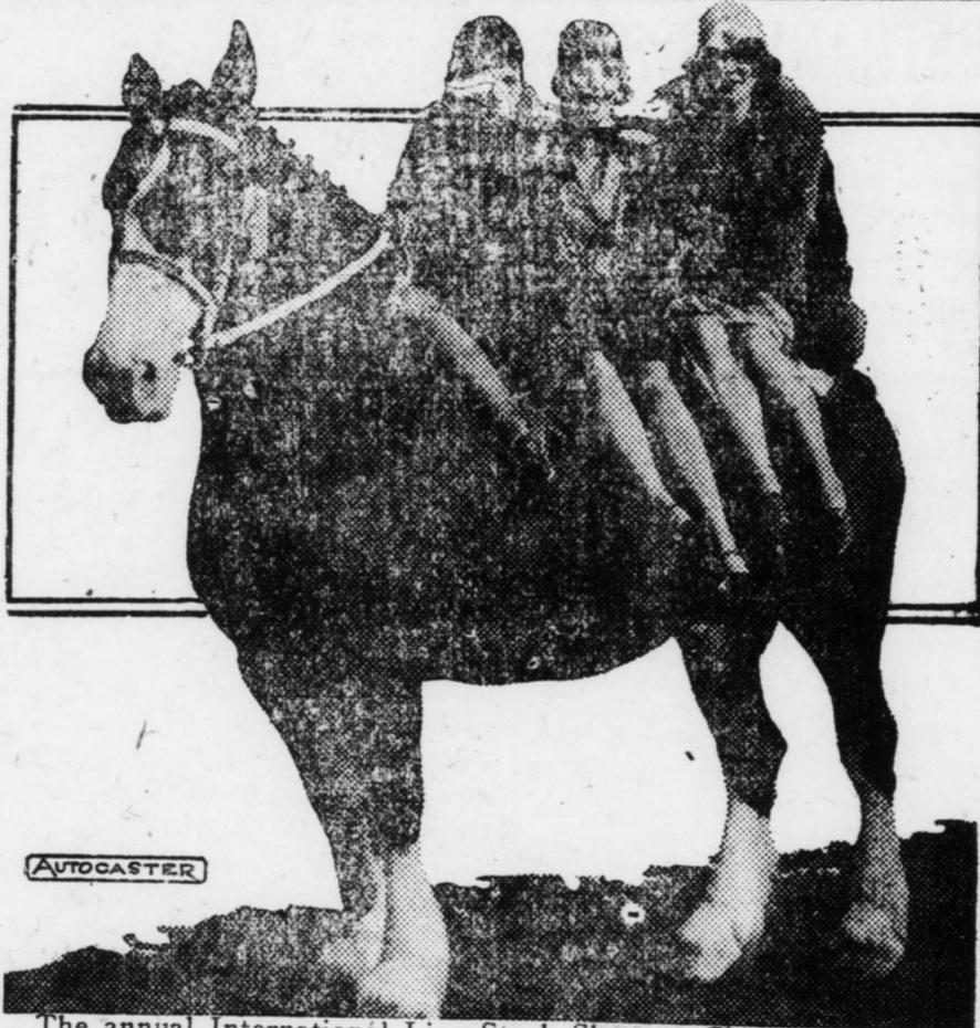
The annual International Live Stock Show at Chicago, November 26 to December 3 is attracting thoroughbred stock from all points of the country "Baldy" above, arrived early to pose thus.

It will pay you to visit the Buck Stores, next door to People's Drug Store. Big money-saving sale now going on.