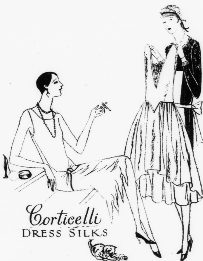
Corticelli DRESS SILKS