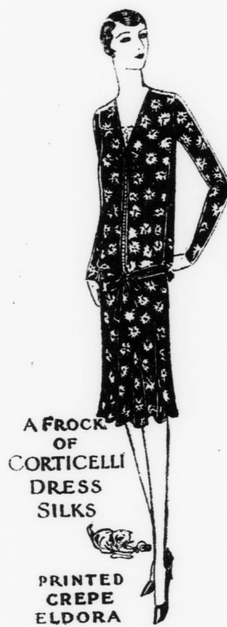
A FROCK OF CORTICELLI DRESS SILKS