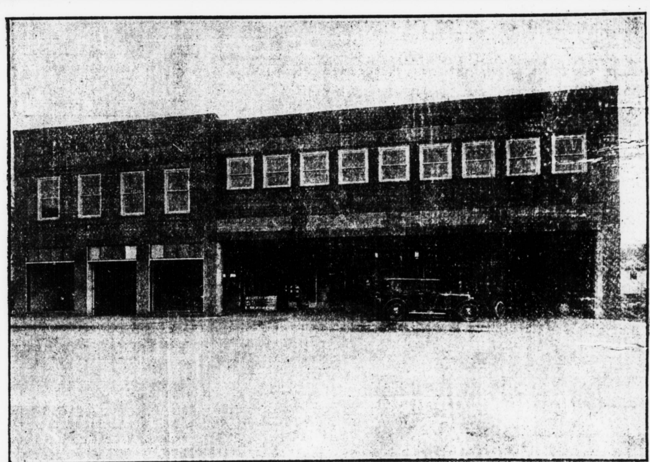
Not a fire this time caused the people of town and community to visit the above shown building.