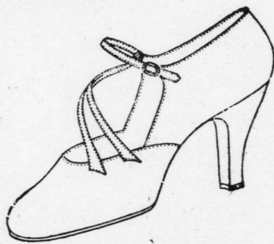
"THE PHANTASY" Lustrous Black Satin with Gun-metal Silk Kid Straps. Price $12

You will also find here several other styles that will enhance the becomingness of your Spring costume.