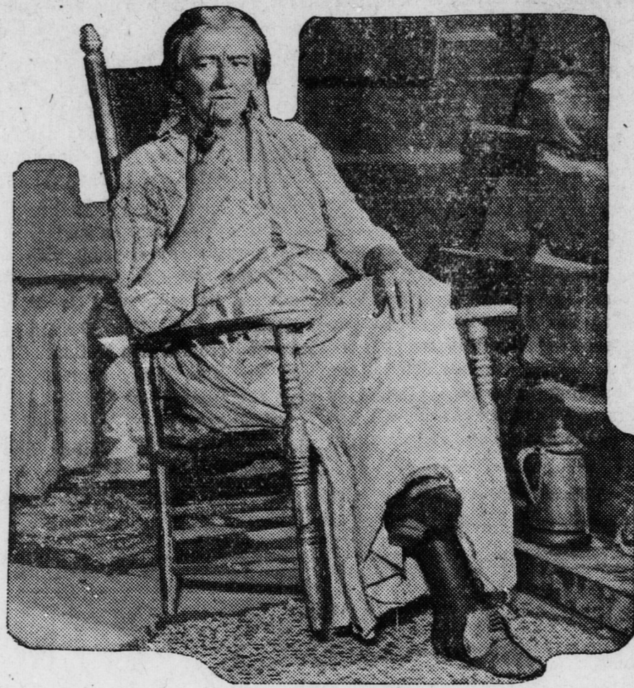
THE WIDOW CAGLE IN "SUN-UP," POWERFUL DRAMA TO BE PRESENTED AT CHAUTAUQUA

"Sun-Up," vivid drama of the mountain people of North Carolina, will be one of the big attractions of the coming Redpath Chautauqua here. It will be presented by an unusually fine New York cast.