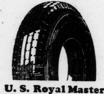
U. S. Royal Master

This announcement is of vital importance to every car owner in this community. You can now secure famous U. S. Tires from a dealer known for an exceptional type of service. largest producer of rubber. That means lavish use of virgin rubber resulting in thousands and thousands of extra non-skid miles. They are manufactured by exclusive processes resulting from 38 years of tire-building experience.