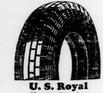
U. S. Royal Heavy Service Balloon