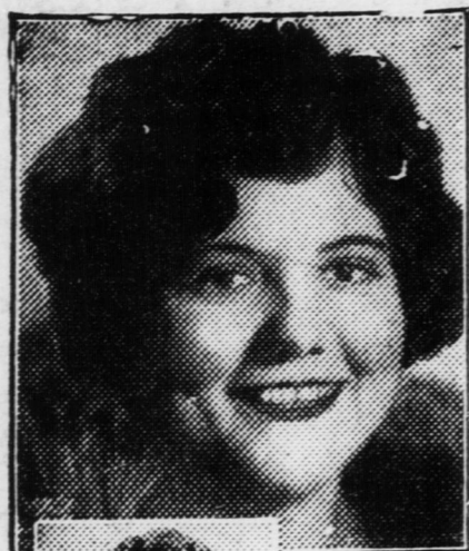
"Smile at the Ache"

Ordinary pains—headache and neuralgia, muscular pains, functional pains, the headache and congested feeling of a cold in the head—how quickly they disappear when you take a tablet or two of