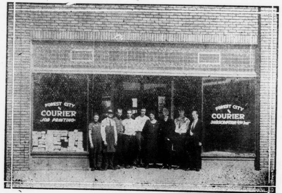
The Home of Good Printing

The Forest City Courier maintains an exclusive job printing department, separate from the newspaper, and therefore can give your rush orders immediate attention any day in the week. This department is in the hands of expert workmen.