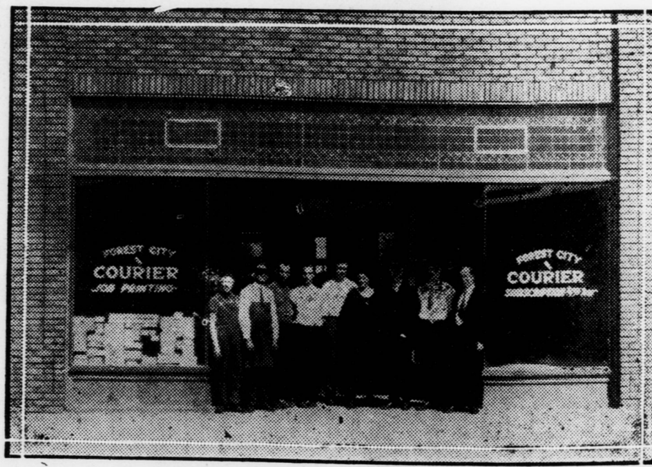
The Home of Good Printing

The Forest City Courier maintains an exclusive job printing department, separate from the newspaper, and therefore can give your rush orders immediate attention any day in the week. This department is in the hands of expert workmen.