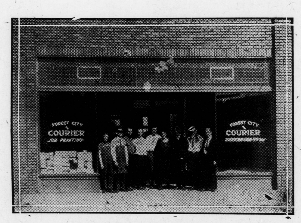
The Home-of Good Printing

AT LAST! The crowning achievement of a master weaver romance-of a great soul-gripping director-and a star name is a synonym of perfection in dramatic artistry.