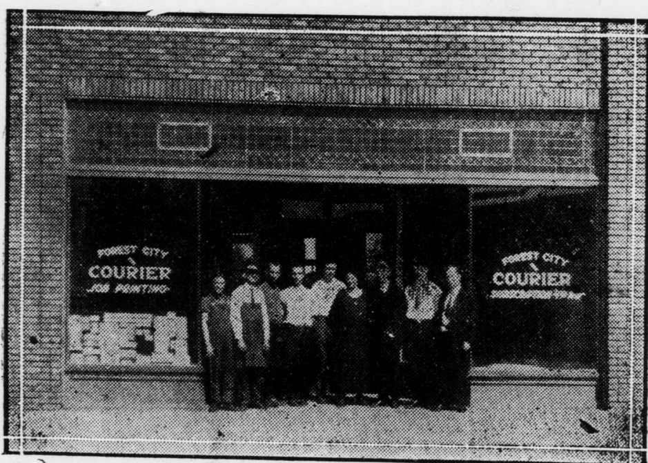
The Home of Good Printing

The Forest City Courier maintains an exclusive job printing department, separate from the newspaper, and therefore can give your rush orders immediate attention any day in the week. This department is in the hands of expert workmen.