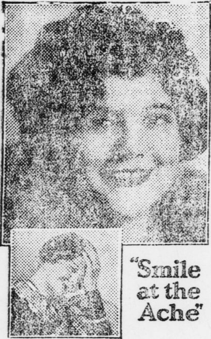
"Smile at the Ache"

Ordinary pains—headache and neuralgia, muscular pains, functional pains, the headache and congested feeling of a cold in the head—how quickly they disappear when you take a tablet or two of