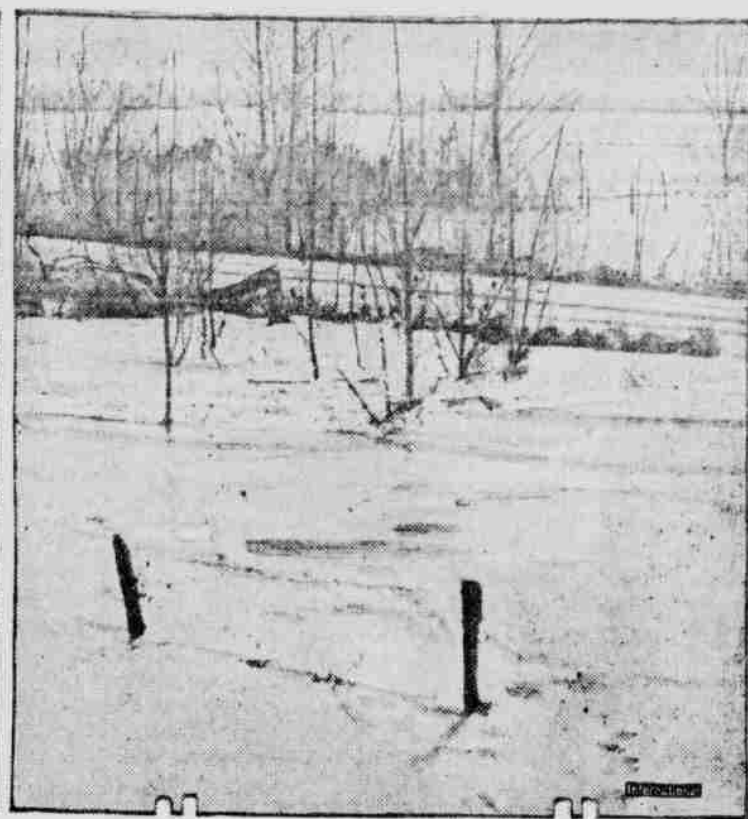
Great tracts of central Louisiana were inundated when the levees on the west bank of the Mississippi river gave way. This picture, made across from Vicksburg, shows the flood waters rushing over the Dixie highway.