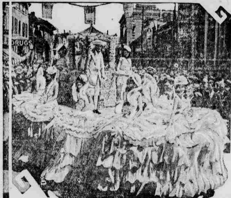
This float won first prize in the Apple Blossom parade at Winchester, Va. Beauties of the Shenandoah valley were garbed in old-fashioned dresses in the apple blossom colors, pink, white and green.