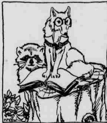
He Looked Very Wise.

"I must tell you," said Daddy to Nick and Nancy, "about Spud Coon's New Year's resolutions. "Spud Coon had been a very naughty raccoon during the Christmas holidays. "He had been stealing a great many of Farmer Wells' chickens. "He had given a number of chicken feasts and had also gone to many parties. "He had always come home very much exhausted and stayed asleep even longer than he should have done. "Of course too many parties and too many chicken feasts and not enough rest and good exercise made Spud Coon feel quite poorly. "He got extremely worried about himself, and one evening—it was New Year's Eve, by the way—Spud Coon decided he would go see Dr. Red Fox. "Now, Dr. Red Fox had been very naughty when he was a little fox, but age had given him a great deal of com-