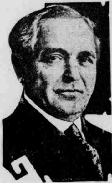
Frank J. Harwood of Appleton, Wis., moderator of the National Council of the Congregational Churches in the United States, which opened its biennial meeting at Omaha, Neb. The council represents 5,000 churches with 814,000 members in this country.