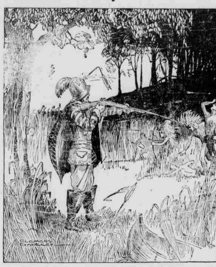
Champlain and the Iroquois. A test of the Indian's bow against the white man's firearms. Find Champlain's companion.