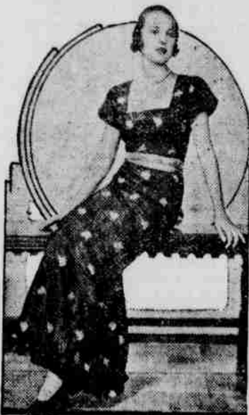
A picturesque fitted empire frock in metal-brocaded faconne taffeta. The ruche about the hem is fascinating.