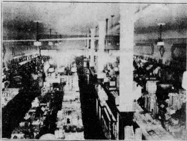
Interior View of Morehead City Store

A busy scene is presented in the Morehead City store on Saturdays and during the holiday seasons and business is good there at all times, according to Mr. Kite the manager. The Morehead City store interior is similar in style to other stores of the chain and is very much like the interior of the new Beaufort store. It is located on Arendell street in the business section of Morehead City.