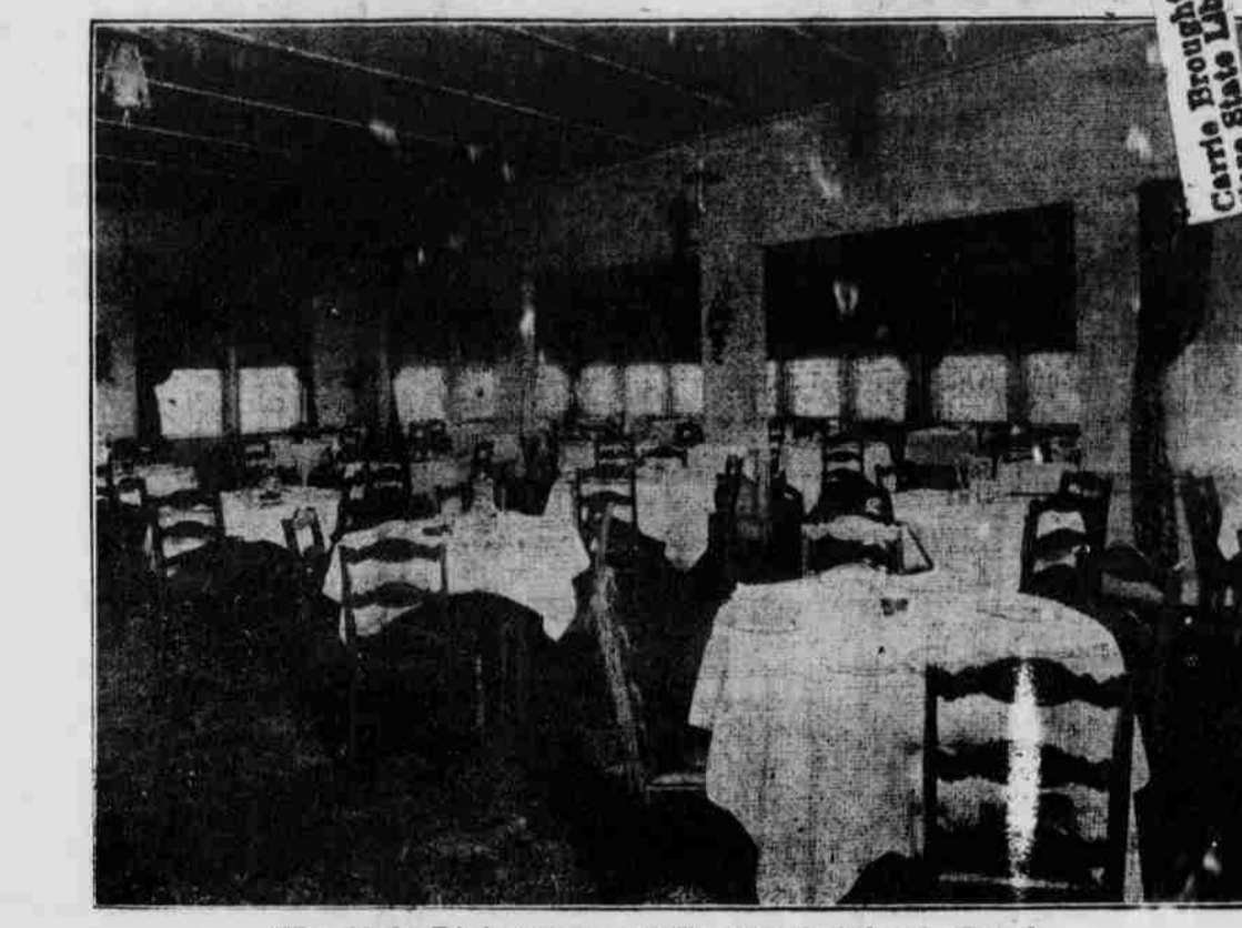
The Main Dining Room of The Hotel Atlantic Beach