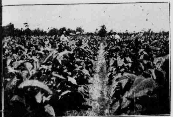
To Represent Beaufort