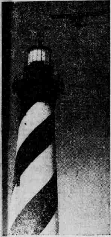
PICTURED ABOVE is the Stinson cabin plane of Pilot Dave Driskill over Cape Hatteras Lighthouse, the tallest brick light tower ever built. Patrons of the Beaufort-Morehead City Atlantic Beach.