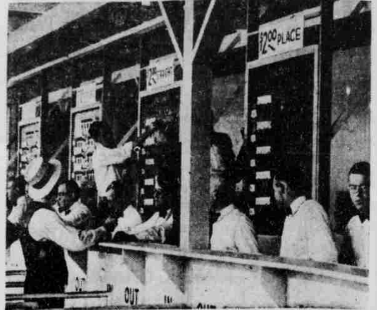
Photographs shows typical pari-mutuel horse race betting machines which will become legal in New Jersey if that state adopts a referendum measure being voted Tuesday. Reverend Lester H. Cleo, former state senator and Republican candidate for governor in 1937, has been leading a state-wide fight against the measure.