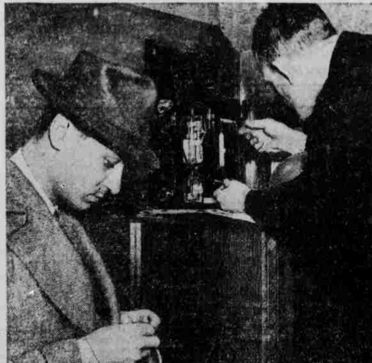
Indiana became Thursday the first state to provide that courts may recognize scientific tests for intoxication as evidence in cases involving drunken and reckless driving. The new Indiana law provides for analysis of breath and body fluids similar to that shown above in which a model's breath, blown into a balloon, is being tested for alcohol content.