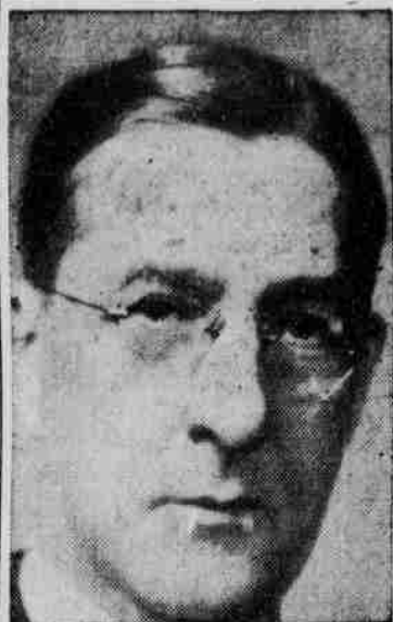
SENATOR JOSIAH BAILEY