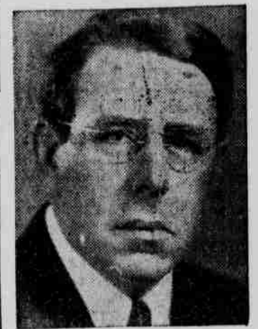
GOV. NOMINATE BROUGHTON