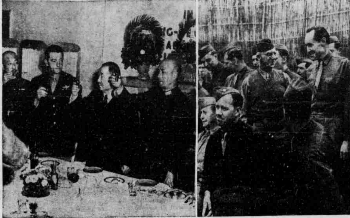
Shown at left is a scene at the banquet given in Chungking, China, by the Chinese Aeronautical commission, to honor Brig. Gen. Claire Chennault, who won lasting fame as leader of the Flying Tigers, on the occasion of General Chennault's appointment as commander of the 14th U. S. air force. General Chennault is second from left. In picture at right, Lieut. Gen. Joseph Stilwell, commanding general of the China-Burma-India area, is shown (with sweater) chatting with some of his officers at a base somewhere in China. Both generals recently have had talks with Gen. George Marshall, chief of staff, in Washington.