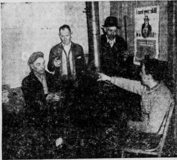
Relaxing under the comfortable heat of a stove, these four miners discuss their No. 1 topic, the six-day week for miners under government supervision of the mines. The six-day week was ordered by Fuel Administrator Ickes throughout the coal mining industry as work generally was resumed, after a nation-wide walkout.