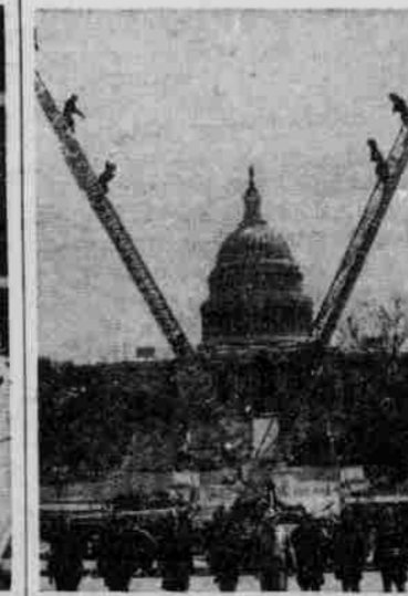
Celebrating the successful conclusion of the second war loan drive, the District of Columbia fire department displays its own version of the V-for-Victory sign by using two of their long extension ladders.

MEDICATED POWDER FOR FAMILY USE Soothes itchy of simple rashes with Mentosin, formerly Mentosan. Heat Powder. Relieves Heat Rash, Diaper Rash, Heat Rash.