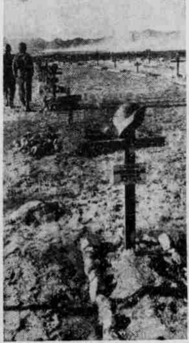
When U. S. troops entered this Tunisian valley they found the graves of 120 "supermen" who had lost their lives in battle with the Allies. The scene of their final resting place is calm and peaceful now as American boys walk through the rows of crosses marking Nazi graves.