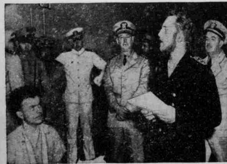
After the 33 survivors of a German submarine were landed at an Atlantic port they were given a hearty meal. Here the executive officer of the sub repeats in German instructions given him by U. S. navy officers as the crew ate. The sub was sunk by depth charges and gunfire from the coast guard cutter Icarus.