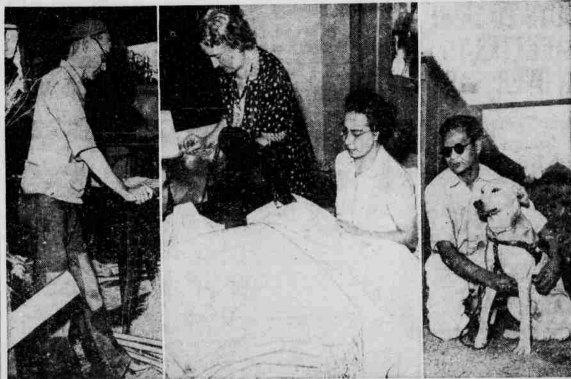
Inspiring pages in the story of America's war effort are being written daily in the Oakland, Calif., Industrial Home for the Blind. Here skilled craftsmen produce clothing and bedclothes for the armed forces, in addition to making brooms for state hospitals. At left a blind worker cuts and trims a broom after it is bound on the handle. Center: Two blind women are busily engaged in sewing pillow cases. Right: A worker with a Seeing Eye dog. The dogs guide the blind when they wish to leave the home.