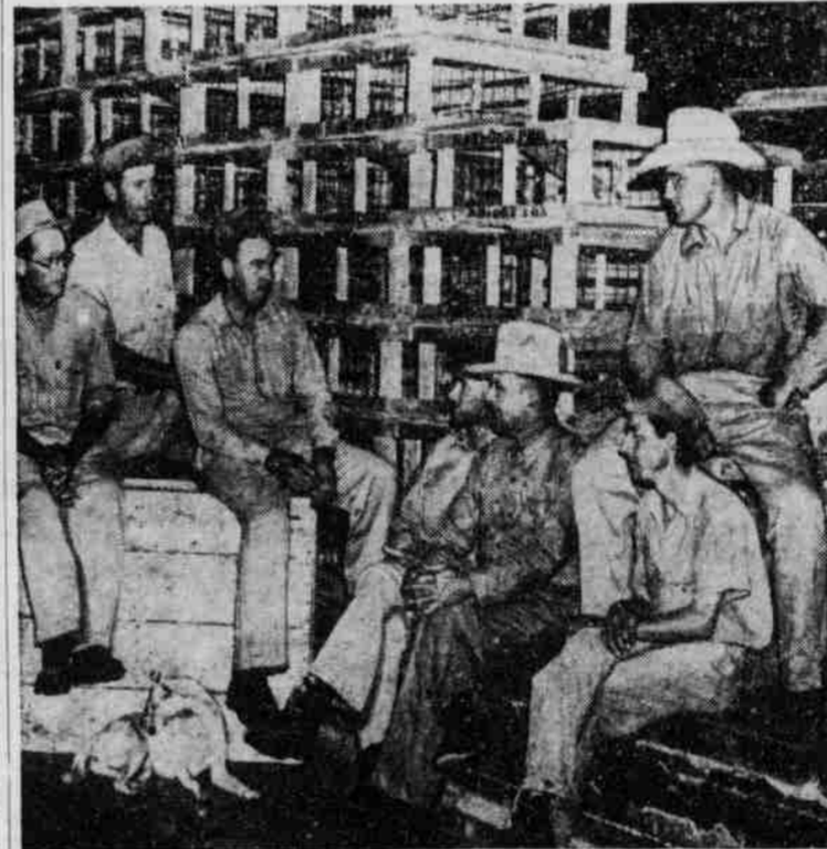
In Gonzales county, Texas, third largest poultry producing county in the United States, the chicken farmers claim that they cannot make a profit, and many of them intend to go out of business for the duration. Here several farmers are discussing their problems against a background of empty chicken cages.