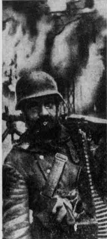
Bag-eyed with battle-weariness, a German grenadier shoulders his light machine gun against the usual "New Order" background of fire and destruction. This photo was taken in Zhitomir, Russia.