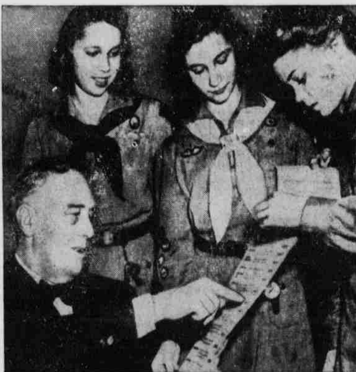
A "check" for 15,430,000 hours of service by Girl Scouts since Pearl Harbor was presented to the President by three Girl Scouts, who represented the 850,000 members of their organization. Attached to the check was an invoice listing the type of work the Scouts have done for their country in wartime.