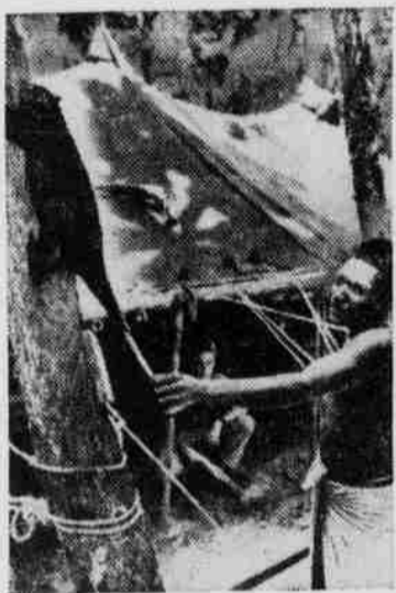
Their prowlings through the tree-tops at night, which keep U. S. infantrymen in state of tension, have earned for banana bears the name "ghosts of Bougainville." Specimen shown here jumped from a tree onto a headquarters tent.