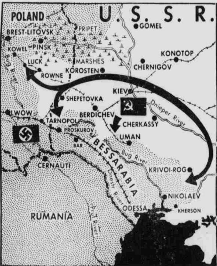
This map shows how the new Russian drive which ripped a 106-mile gap in the German lines south of the Dnieper bend, placing some 500,000 German troops in danger of capture or slaughter, may carry the Red army to the border of Rumania. From the north below the Pripet marshes, one spearhead strikes towards Rumania via Tarnopol while another strikes towards Luck.