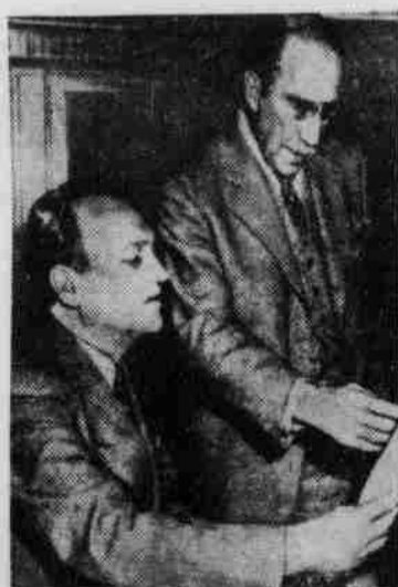
The senate approved the soldier vote compromise measure by ballot of 47-31. Senator Lucas (Ill.), left, and Senator Green (R. I.), co-authors of original measure, look over compromise bill.