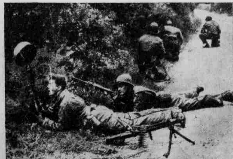
Taking care to keep well down out of harm's way, American soldiers take part in a sniper hunt somewhere in France. The soldier in the foreground pokes his helmet up over the edge of the ditch, hoping and asking for the sniper to take a shot so his position can be located. Snipers soon surrender when located.