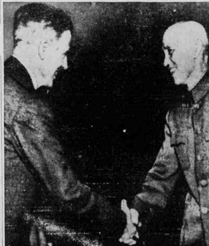
Vice president Henry A. Wallace is shown being welcomed to China by Generalissimo Chiang Kai-Shek, when Wallace's plane landed there. The vice president not only carried state papers, but was well equipped with seeds, industrial plans, various items which had been asked for by welfare organizations operating in China. Before leaving the United States Wallace had "mastered" the Chinese language.