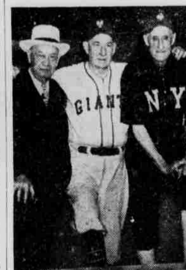
Baseball stars of another era made their appearance at the Polo grounds where the three New York teams, Yankees, Dodgers and Giants, played a three-cornered game for the Fifth War Loan drive. Admission was only by purchase of war bonds.