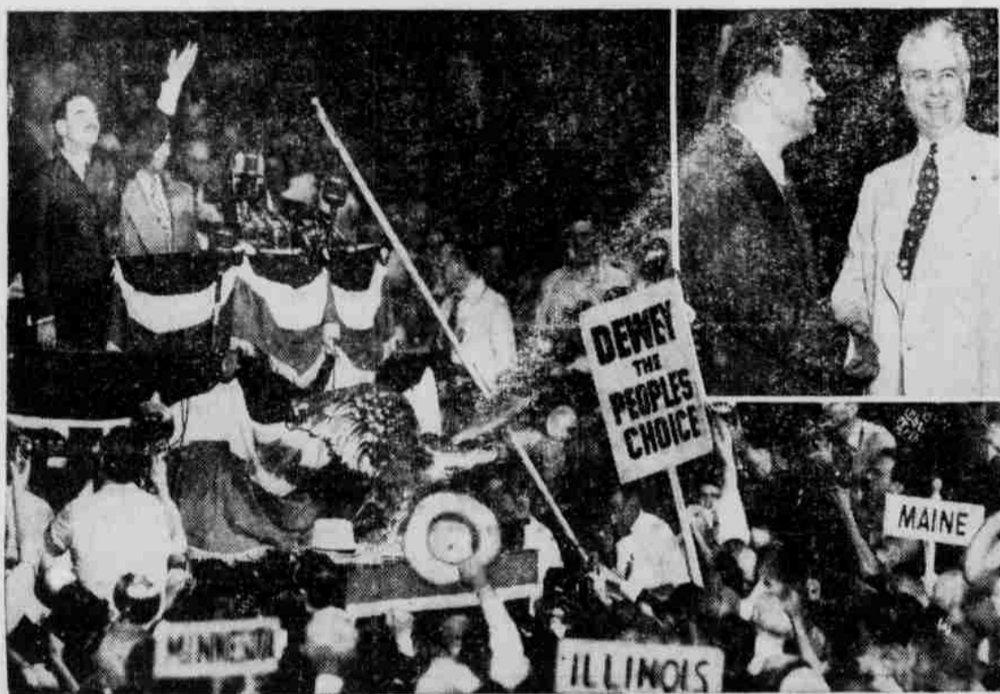
It's Dewey and Bricker and an impressive scene in the Chicago stadium as the Republican national convention delegates stampeded when Gov. Thomas E. Dewey of New York accepted the presidential nomination. Gov. John W. Bricker of Ohio, proved just as popular with the delegates as he clasped hands with Dewey, following his acceptance of the vice presidency nomination.