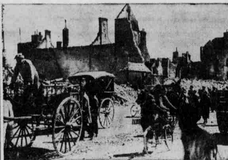
Terrific shelling and bombardment reduced this town of Isigny, France, to just a shell of its former self, but to these Frenchmen it is home as they move back to normalcy in their village after it was occupied by the American army during the invasion of the Normandy coast.