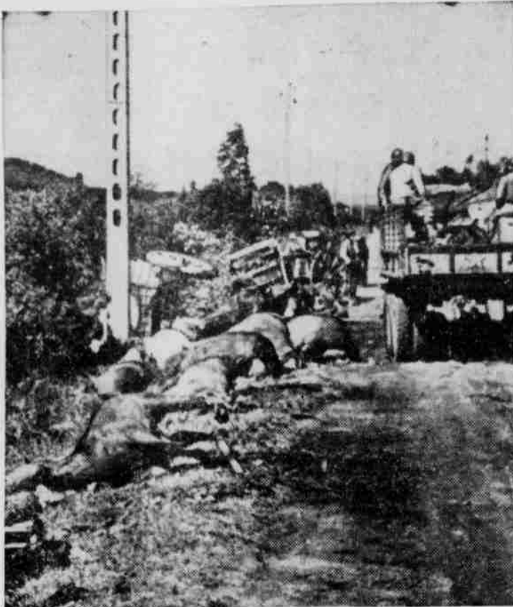
On the road to Barneville, Cherbourg peninsula, wrecked German guns, dead horse and other equipment lie alongside the road after being pushed there by American bulldozers, which cleared the road for the advance of the Allied troops which followed in the advance on Cherbourg. An American truck advances down the road.