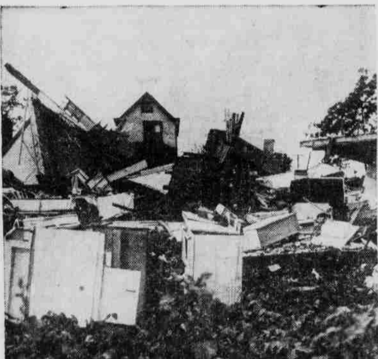
Wash basins and dresser drawers form part of the general wreckage, when the tornado struck B avenue, Liberty borough, Pittsburgh. Houses were lifted completely from foundations and furnishings flung far and wide. List of dead and injured were reported at 154 dead and 1,100 injured in the worst disaster in Pennsylvania's history, since the Johnstown flood. Thousands were taken care of by Red Cross rushed to the scene.