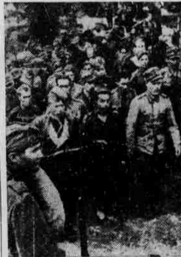
Finnish officers and men taken prisoners on the Karelian Isthmus are shown being marched to prisoner of war enclosures. In the background are some of the fortifications of the Finnish defense zone.