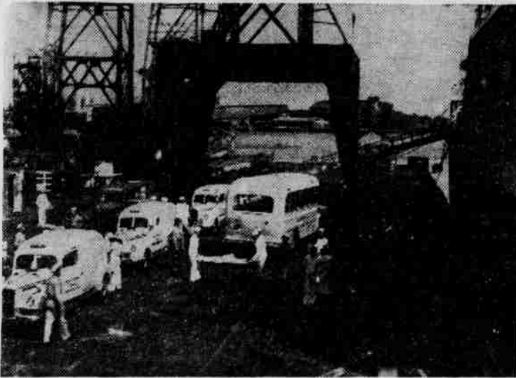
Ambulances line up on the waterfront at Norfolk, Va., to take naval invasion casualties off the hospital ship "Refuge" shortly after its arrival from Europe. These are the first invasion casualties to be debarked at Norfolk. As soon as conditions will permit they will be transferred to hospitals nearest to their homes. Most of them will return to duty.