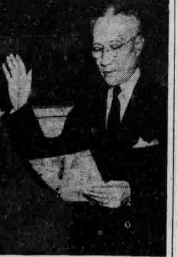
Sergio Osmena, vice president of the Philippine commonwealth, is shown as he took the oath of office of president at Washington, following death of Manuel Quezon.