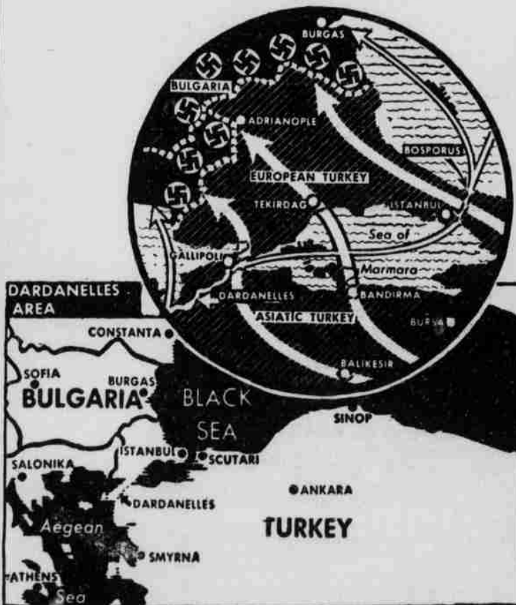
After more than four years as a neutral, Turkey has broken relations with Germany. The Allies are expected to ask for and be granted bases from which to blast the Germans from the Aegean Isles and to attack Nazi satellite countries. The Turkish army might then move against Bulgaria, whose border is reported strongly fortified.