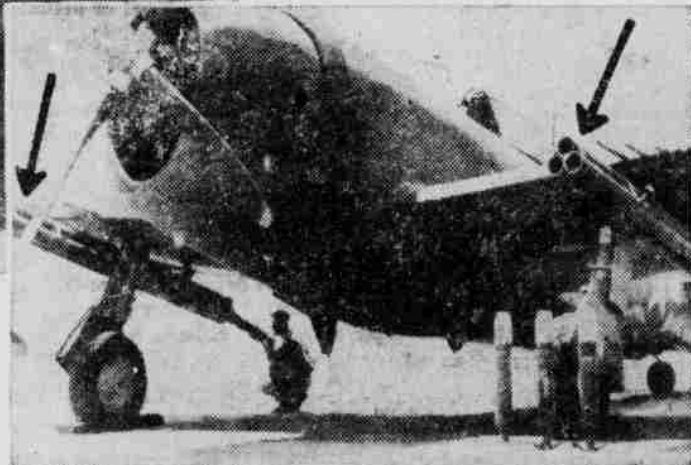
Yank shown loading a projectile into the rocket armament of the far wing of the P-47 Thunderbolt. Arrows indicate the rocket projectiles, one on each side of the Thunderbolt. Nazis complain that the new rocket is "unfair" and does not give them sufficient opportunity to get under cover. U. S. army officials report that its effect will be increased.