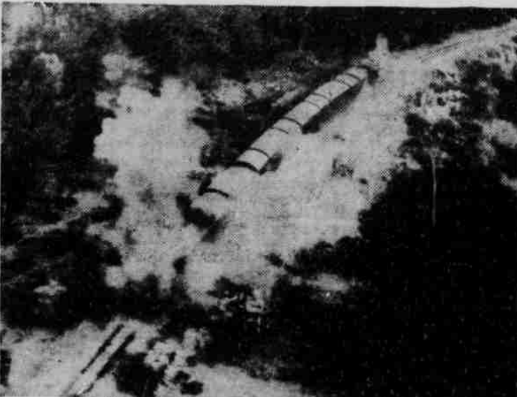
A Beaufighter of the Royal air force sweeps low over the jungle and opens up with cannon fire on a Jap supply train near Kambalu. Allied planes have caught and wrecked many enemy trains laden with war materials on their way to the front.