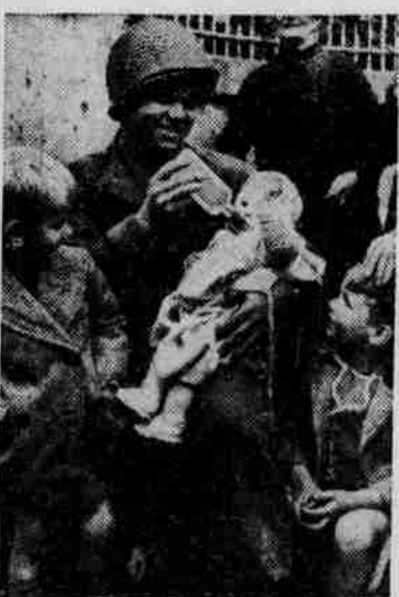
The GIs are versatile. This fighting man puts down his gun to play nursemaid or foster mother, to a little French girl who is still on the bottle. These children were among a group of civilians evacuated from Tribehon.