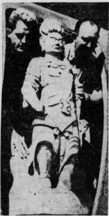
This wooden figure of a Japanese warrior god was among the war booty found on Saipan after the invasion. It is believed to represent the dual personification of the Japanese Buddha and the protective god of warriors.