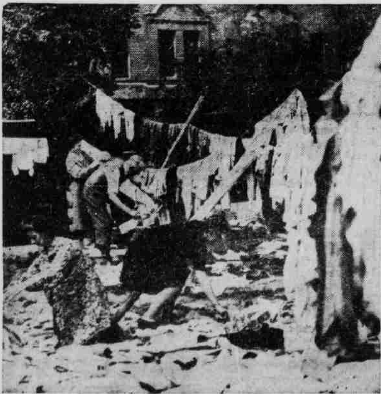
English families are pictured salvaging some of the clothing and hosiery still intact, after a Nazi flying bomb had wrecked a big outfitter's store in southern England. The goods were said to have been scattered far and wide by the force of the blast. Some 5,000 of these bombs have fallen in England.