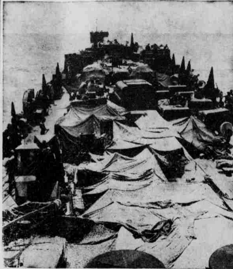
The upper deck of this LST, one of the assault ships en route to Guam in the Marianas, is packed to capacity with marines and their equipment. The camouflaged shelter-halves and ponchos in the foreground were strung up by the Leathernecks to provide daytime shade and a dry sleeping place at night.