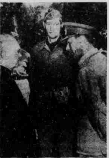
Archbishop Francis J. Spellman of New York, military vicar of Catholic Chaplains, left, greets King George VI of England as Lieut. Gen. Mark Clark of U. S. Fifth army (center) looks on.