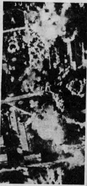
Dramatic raid on Formosa shows the devastation caused by warplanes operating from fast carriers on their visit to Kagi, important military, rail, and industrial city. Objects are shown in a shower of explosions caused by direct hits.