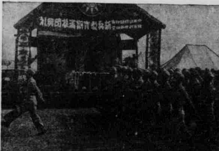
A Chinese battalion passes the reviewing stand during the graduation ceremony at Ramgarh Training center, India, where American-equipped Chinese soldiers learn U. S. combat methods from American instructors before they are sent to one of the Chinese-Japanese fronts. The men are mixed with native troops and are able to direct them in modern warfare. Note the goose step style of marching.