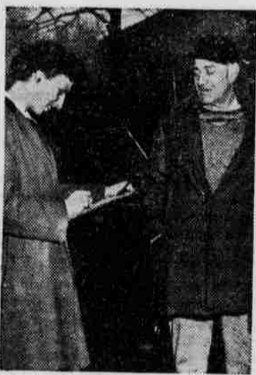
With approximately 30,000,000 Americans living on farms, the farmer's vote is the most important mass vote in the country. Here a poll reporter questions a New Jersey farmer, who has plenty to say about price controls, farm subsidies and the election. Like the thousands who are being polled by various agencies in the country he votes for the next President.