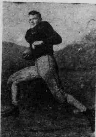
Glenn Davis, West Point's substitute, stands as the top scorer of the eastern football world, which includes college and service teams. The Los Angeles boy has scored 62 points.