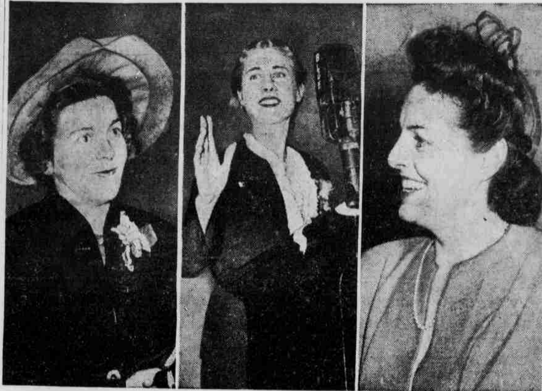
Glamour is being added to the race for seats in congress by (left) Mrs. Emily Taft Douglas, daughter of Lorado Taft, sculptor, and wife of Marine Maj. Paul Douglas; (center) Clare Boothe Luce, playwright, and wife of Henry Luce, New York publisher; and (right) Mrs. Helen Gahagan Douglas, actress and wife of Marine Capt. Melvyn Douglas, movie star.