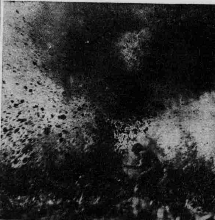
American paratroopers, landing in field near Arnhem, dash forward amid the bursting of German 88s. This picture shows that not all landings were made out of range of the Nazis high-power guns. Long-range lens camera was used in order to secure this photograph.