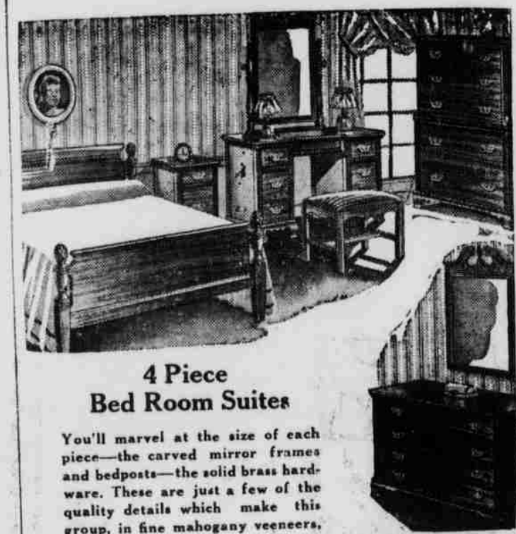
4 Piece Bed Room Suites

You'll marvel at the size of each piece—the carved mirror frames and bedposts—the solid brass hardware. These are just a few of the quality details which make this group, in fine mahogany veneers, so exceptional at this price.