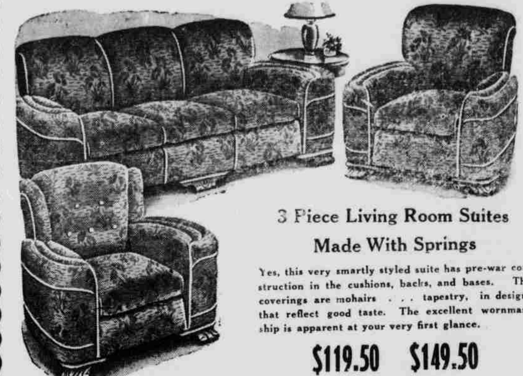
3 Piece Living Room Suites Made With Springs

Yes, this very smartly styled suite has pre-war construction in the cushions, backs, and bases. The coverings are mohairs... tapestry, in designs that reflect good taste. The excellent workmanship is apparent at your very first glance.