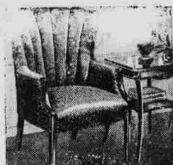
Your choice Chair Fan back, Lounge or wing—