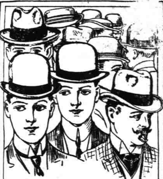
Every Stetson bears the Stetson Name