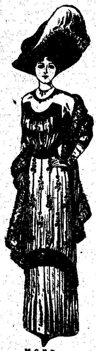
McCull Patterns No. 5731—Waist, No. 5732—Skirt A BEAUTIFUL AFTERNOON GOWN

Just received a great line of Ladies coat suits We can please you if you have a want in this line. We have some very attractive patterns, and prices are exceedingly low. Boys' suits and overcoats If you have a boy that needs a suit or over coat it will pay you to see our stock. We have some great values and can please the most exacting. Don't forget our Millinery Department. Ladies you can supply your hat wants right here at a saving. Some special offerings in men's Clothing and over coats. See the stock and save money. Come to our store for what you want. We have the most complete line in the State.