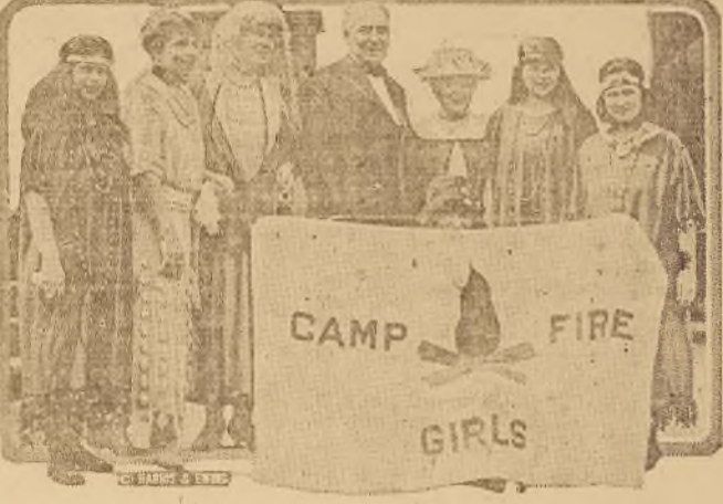
President and Mrs. Harding with representatives of the Campfire Girls of America, at the White House.