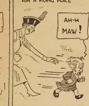
YOU BREAK AWAY AND RUN FOR A HIDING PLACE