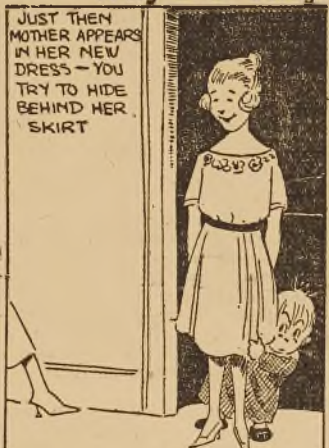
JUST THEN MOTHER APPEARS IN HER NEW DRESS - YOU TRY TO HIDE BEHIND HER SKIRT