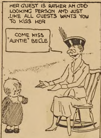
HER GUEST IS RATHER AN ODD LOOKING PERSON AND JUST LIKE ALL GUESTS WANTS YOU TO KISS HER