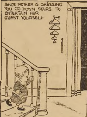
SINCE MOTHER IS DRESSING YOU GO DOWN STAIRS TO ENTERTAIN HER GUEST YOURSELF