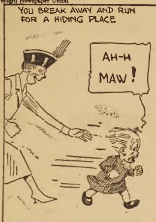
YOU BREAK AWAY AND RUN FOR A HIDING PLACE