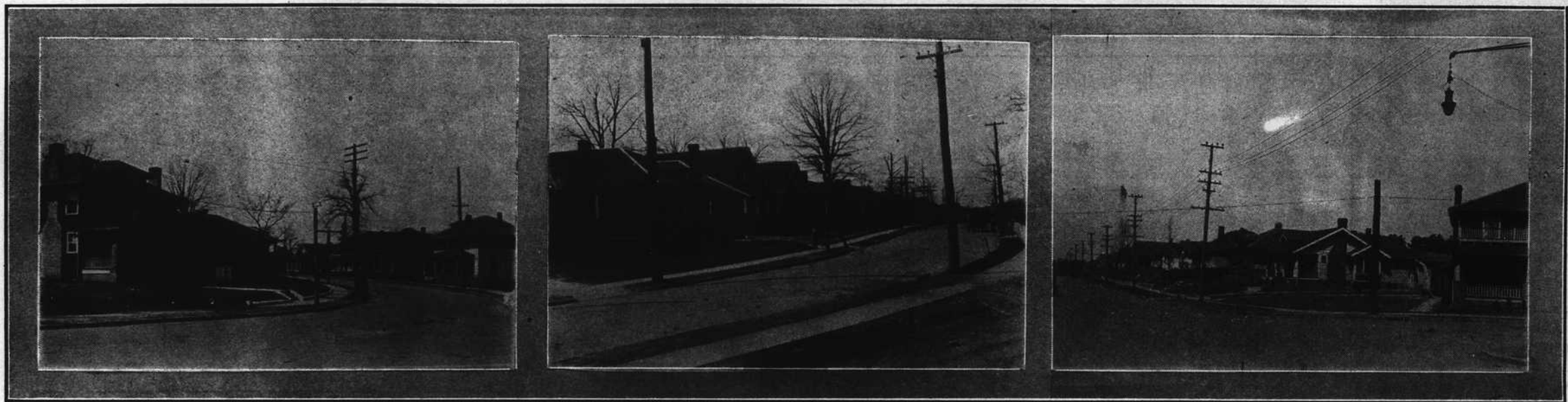
Views Showing Building Development in Wilmore

The Most Available Location in Charlotte for Homes of Moderate Cost