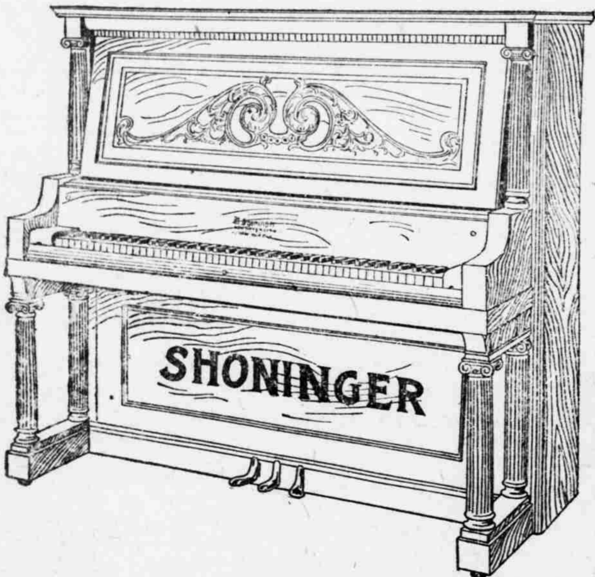
$400 SHONINGER PIANO On exhibition at Darnell & Thomas Music Co., Raleigh, N. C.