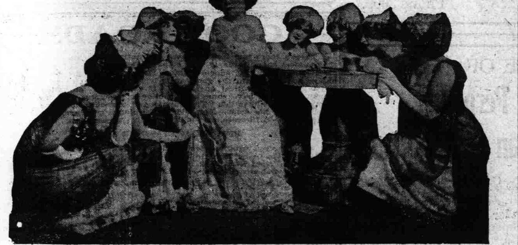
Chorus Group in the Judicial Success, 'The Balkan Princess,' Academy of Music, Matinee and Night, Wednesday, September 11th.

Seat sale begins Monday morning, September 9th at Hawley's. Mail orders for seats out of town people will be accepted now. Owing to the length of the performance curtain rises at 2:30 at matinee, and 8:15 at night. Prices: Matinee . . . . .25, 50, 75, $1.00, $1.50 Night . . . . .25, 50, 75, $1.00, $1.50