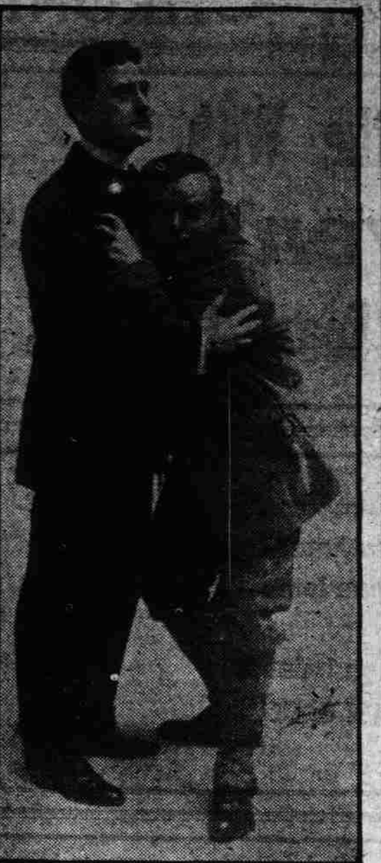
A Scene from 'The Confession.'