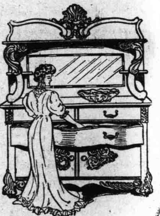
Sideboard in Golden Oak Finish, New $13.65 Design . . .

THE STORE FROM WHICH THIS GREAT PURCHASE WAS MADE BOUND US TO TWO CONDITIONS: FIRST—THAT WE WOULD GIVE NO PUBLICITY AT ALL TO THE TRANSACTIONS UNTIL THE STOCK HAD BEEN TRANSFERRED TO CHARLOTTE; SECOND—THAT WE KEEP THEIR NAME OUT OF ALL ADVERTISING.