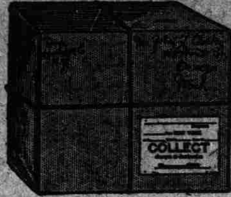
White Label Means COLLECT