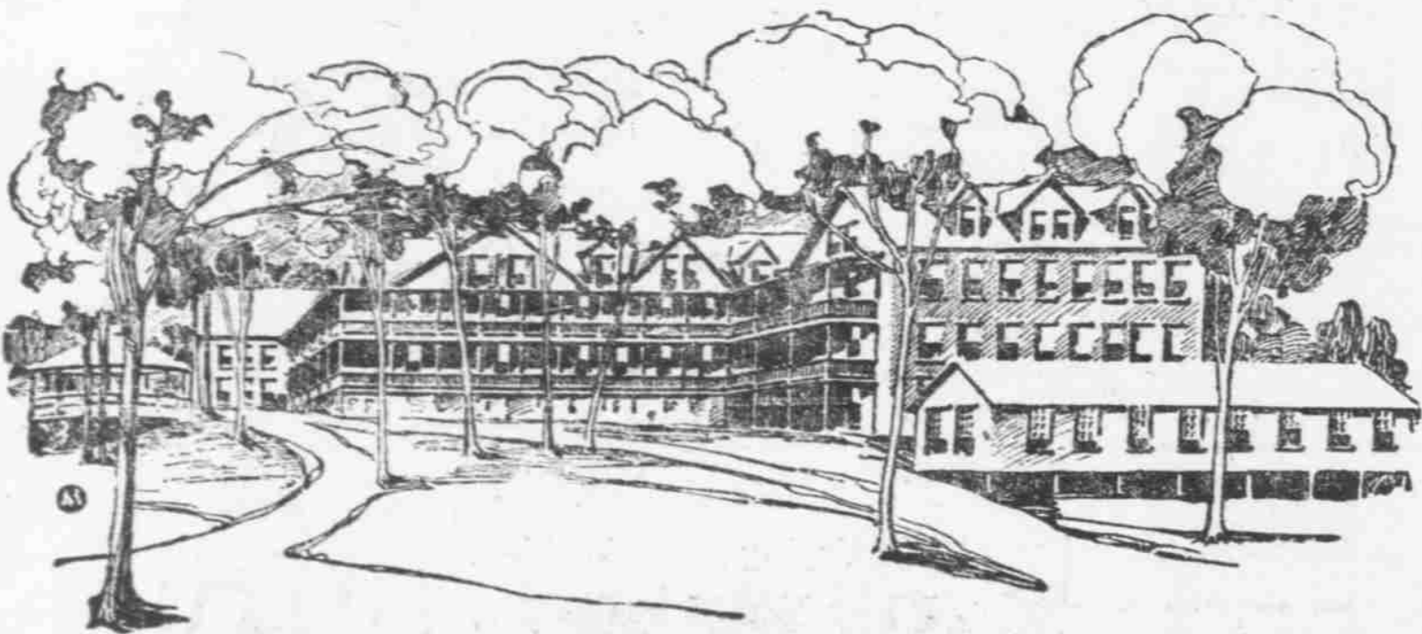
GEM OF THE PIEDMONT REGION