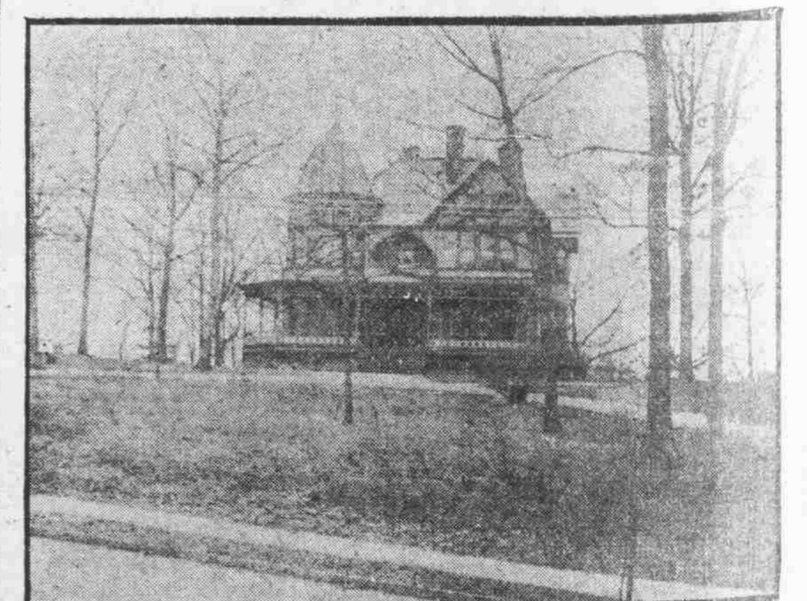
A Beautiful Summer Home or an All the Year Residence.

Situated in fine oak grove on one of the broad well paved avenues of the city and within one block of the car line.