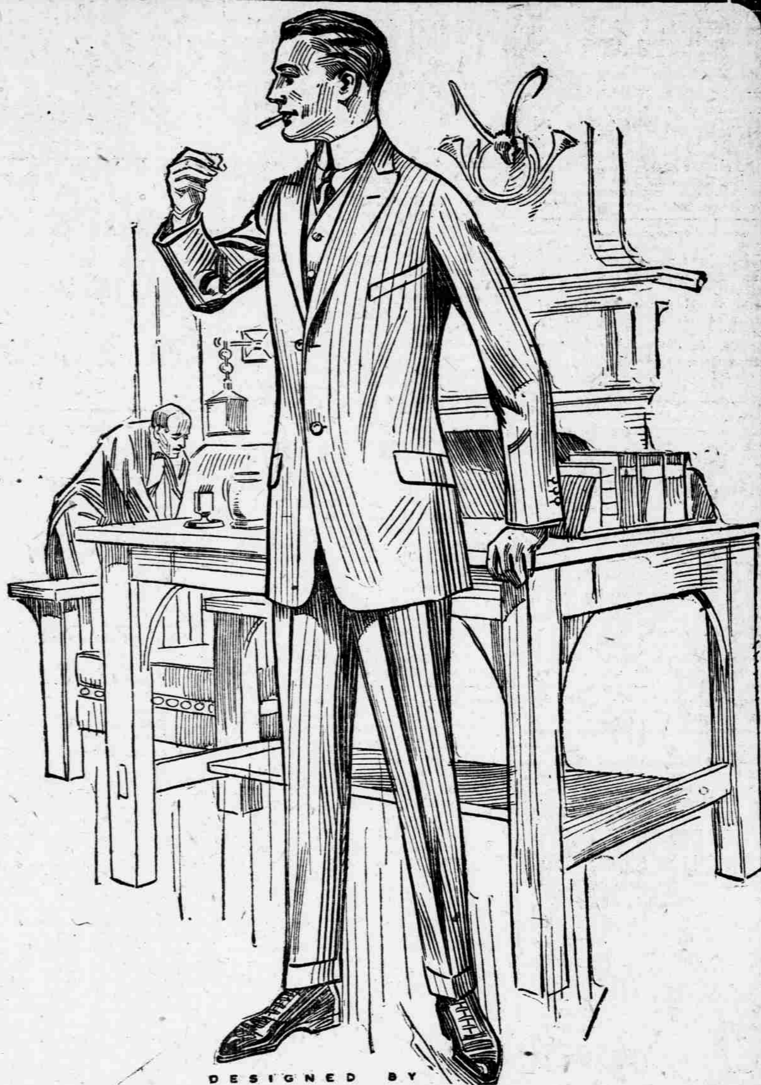
DESIGNED BY Atterbury System