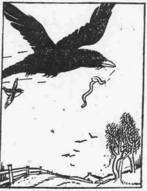
When Mr. Billy Crow spied him coming he changed his mind about visiting this section.

"That wasn't a fly you went out to catch, was it?" asked Tinker Bob of the Kingbird, as he came back to the old stump, "it looks to me like a Bee. I didn't know you liked Bees."