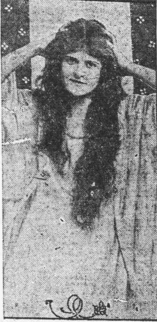
The scalp should be stimulated by proper massage.

Many people pretend that the only value in using hair tonics is the stimulation that the necessary massage gives to the scalp. This is not entirely true. Certain conditions of the scalp can be overcome only by the use of proper tonics when only a very little bit of rubbing is used. These could not be overcome with even the most faithful massage. A combination of both is the best. First out what your scalp needs in the way of ointments or tonics and use them faithfully. At the same time give the scalp sufficient massage to keep it stimulated. A little should be done every day, no matter how unscientifically. When the hair is taken down at night it should be shaken out and the fingers rubbed quickly over the scalp, itself between the hair and to stimulate the circulation of the blood. The scientific way of massaging is to draw the hands through the hair so the thumbs rest against the back of the head and then with the four fingers of each hand to manipulate the scalp with a rotary motion—that is, the fingers do not move over the scalp, but instead they make the scalp itself move. This loosens it—literally stretch it a bit, so that there is room beneath the skin for a tiny layer of fat from which the roots of the hair can