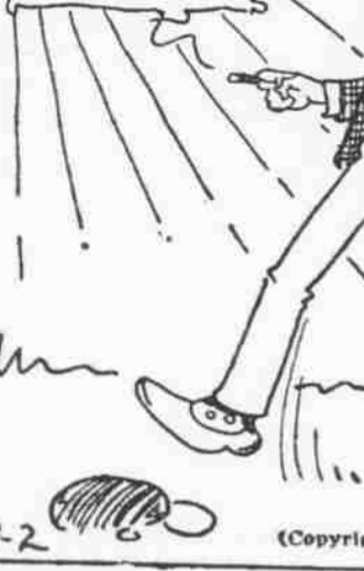
(Copyright 1921, by The Bell Syndicate, Inc.)

AH! WHAT A BEAUTIFUL DAY! LET'S GO AND LOOK OVER UNCLE CYS FARM!