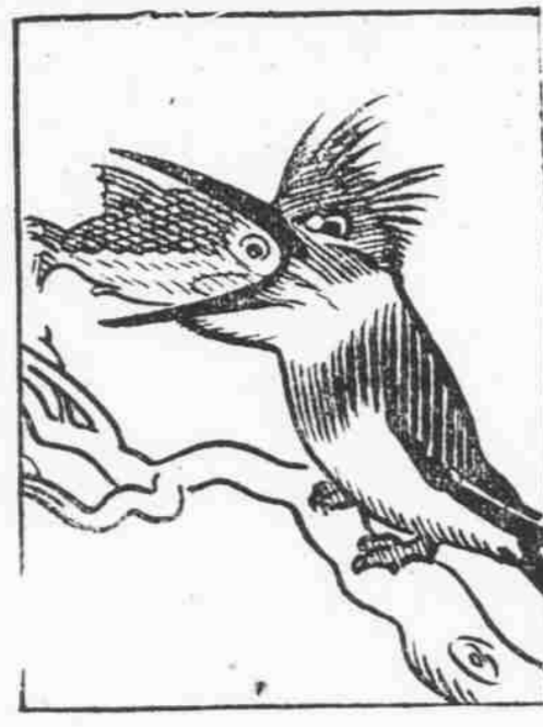
He had a dreadful time getting it down.

Major Pole Cat chuckled as he heard the words of Grandfather Frog. Silky, the Monkey, just laughed so hard that he nearly called the attention of the Fishermen. Tinker Bob had to tell him to be quiet or they would not see any of the sport. But every time he thought of Grandfather waking up inside Long Neck, the Great Blue Heron, it made him want to laugh.