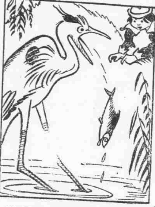
I didn't think there was anyone within a mile, at least, O King.