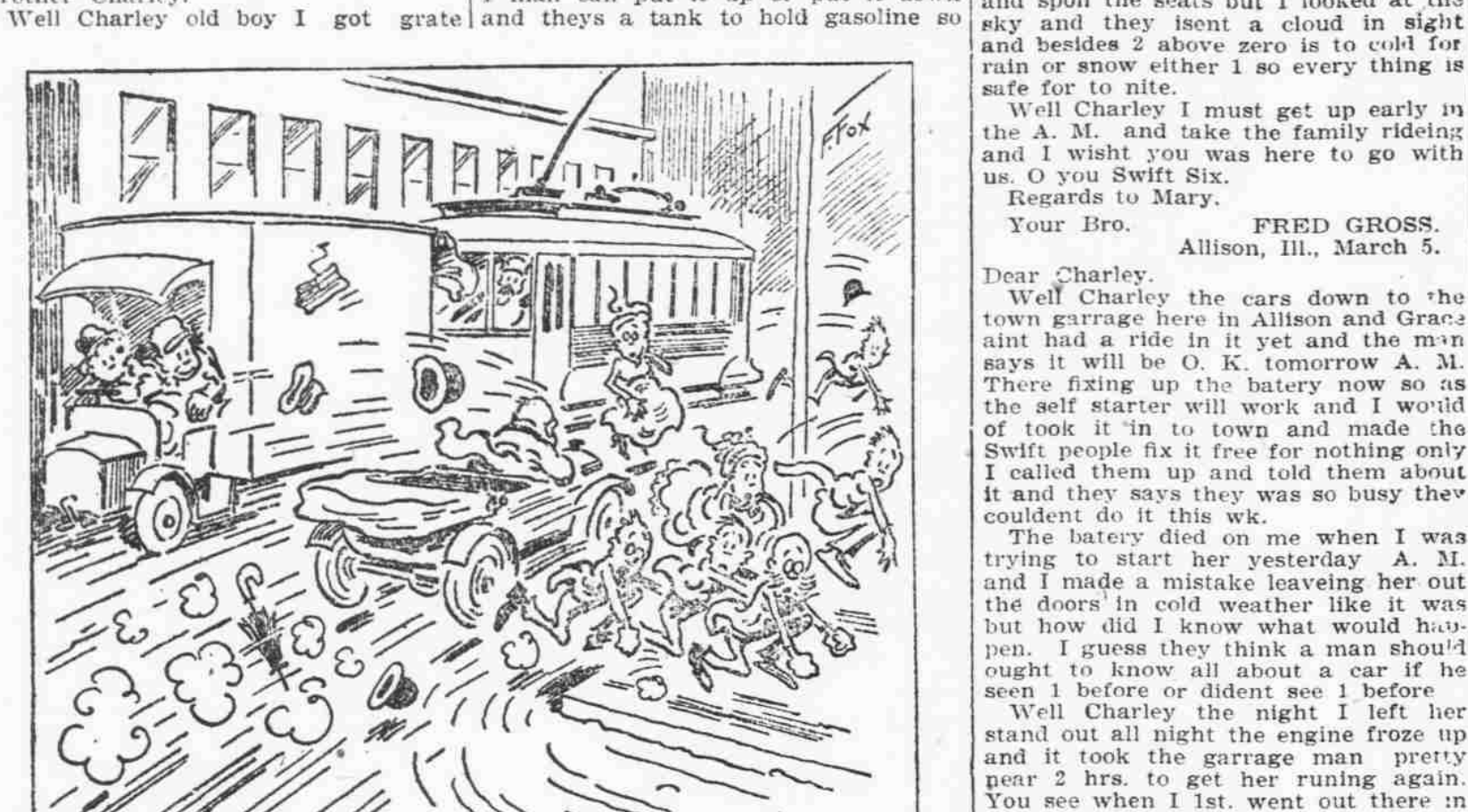
The min. the engine started I shot should and run right at a crowd of people that was crossing the st.

news for you Im a full fledg motorist you dont half to stop at every garnow. What do you think of that Char- rage and buy some more and cush- wasent even no more noise when ley only of coarse I aint got no car ions on the both seats and every vet but I made a payment on it all thing spick and spand. ready and took a driveing lesson and | Well Charley I cant hardley wait I could drive O. K. right now only untill the middle of next wk, but tothese cars like the kind I bought is morrow Im going to take an other such a bargain that every bodys went lesson driveing and then I will be there orders and cant deliver without soon is they got 1 to spare for me, to come down so then I called up the you give them a little time. But they Dont you wisht you was in my shoes promised me mine by the middle of next | Charley but never mind and when